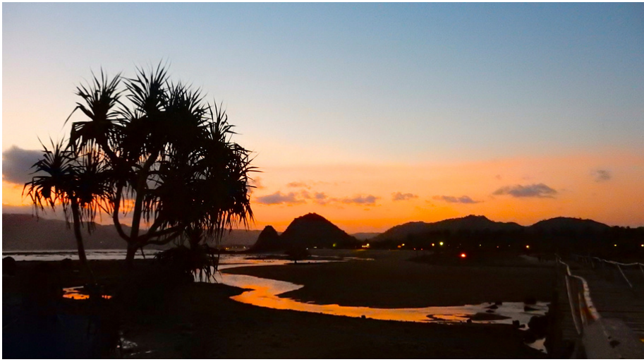
LOMBOK - INDONESIA

Physio Direct Rural Physio at YOUR doorstep