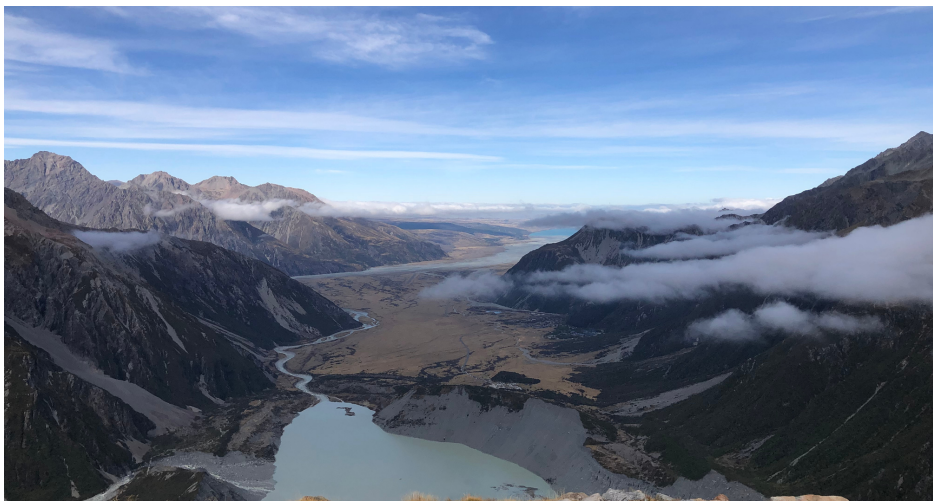
MT COOK - NEW ZEALAND