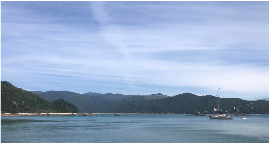
ABEL TASMAN NATIONAL PARK - NEW ZEALAND