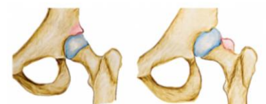
Pincer Impingement Cam Impingement

Hip pain and stiffness with running, squatting and prolonged sitting can be a sign of hip impingement. Your physiotherapist can help diagnose this and guide your treatment.